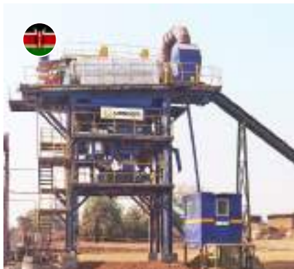
DRX1500DS - Kenya