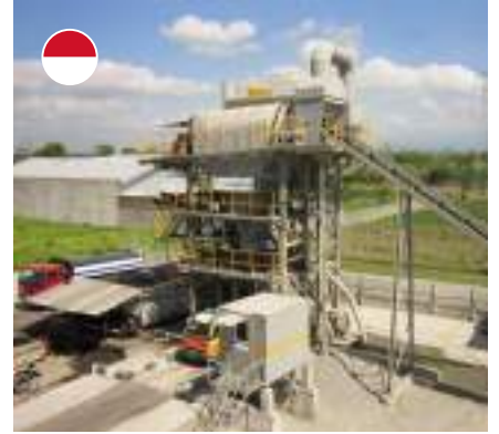
DRX1500DS - Indonesia