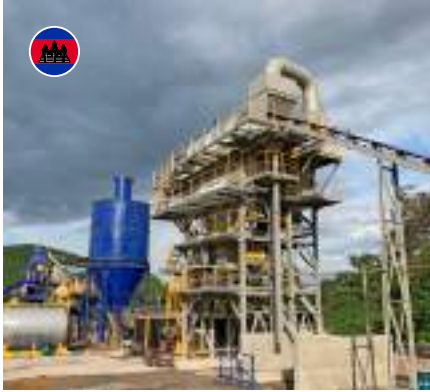
DRX1500DS - Cambodia