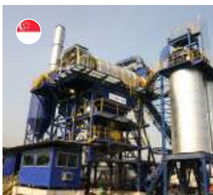
DRX2000DS - Singapore