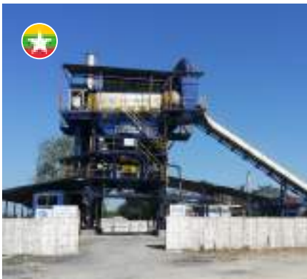
DRX2000DS - Myanmar