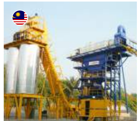
DRX2000DS - Malaysia