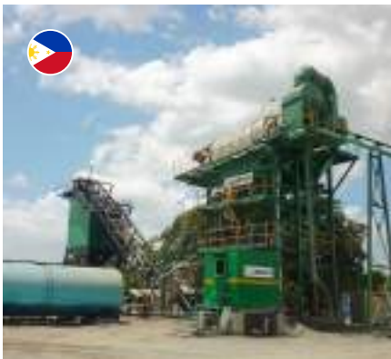
DRX1500DS - Philippines