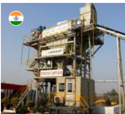
DRX1500DS - India