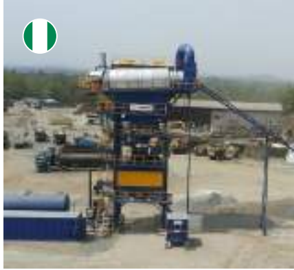
DRX2000DS - Nigeria