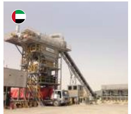
DRX2000DS - UAE