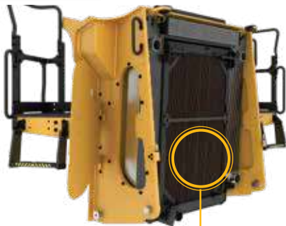
Single plane cooling system reduces heat load for longer component life