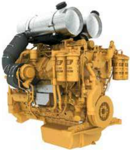
Increased oil pan capacity improves oil quality and engine life