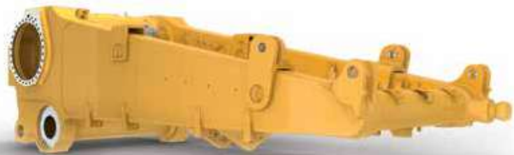
Improved case and frame to increase fatigue life

The durability and reliability of Cat dozers are unmatched in the industry. It's not unusual for a Cat dozer to log more than 100,000 hours.