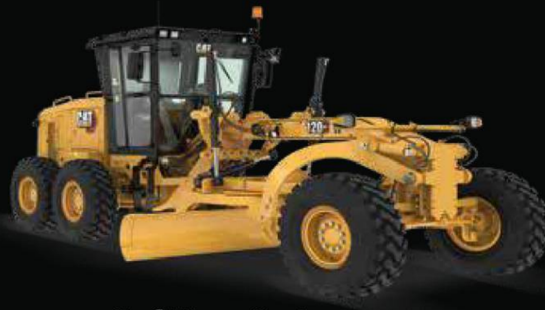
Cat ® Motor Grader