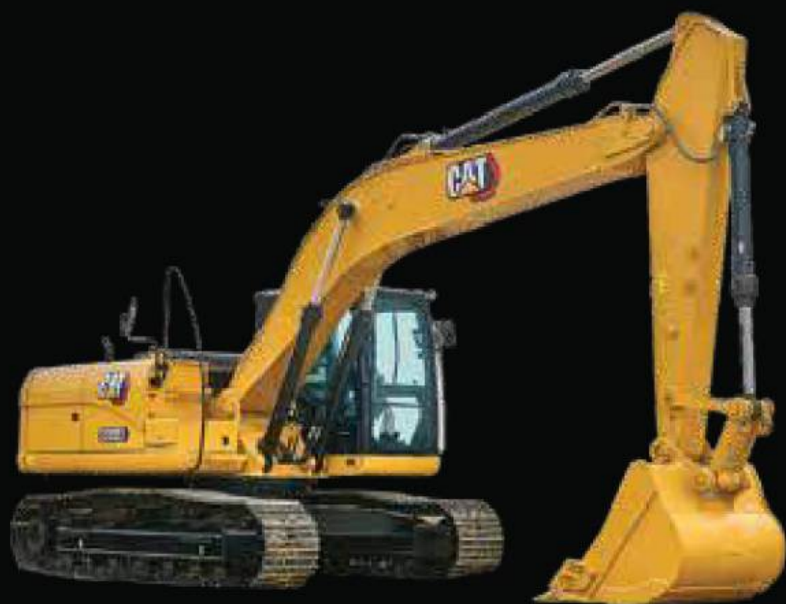
Cat ® Excavator