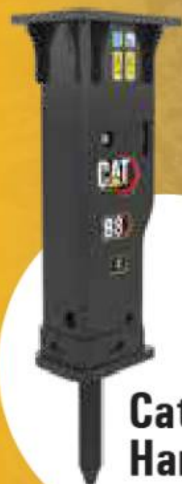
Cat® B8 Hammer

Used across a wide range of construction & light demolition applications